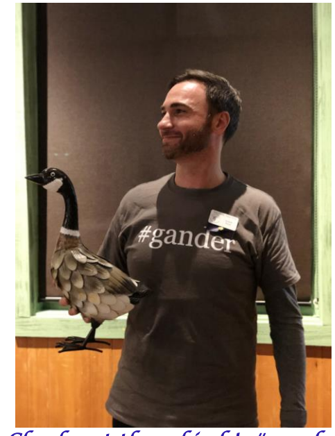
Check out these birds! #gander Our Guardian of the Pond is standing proud with Mother Goose!