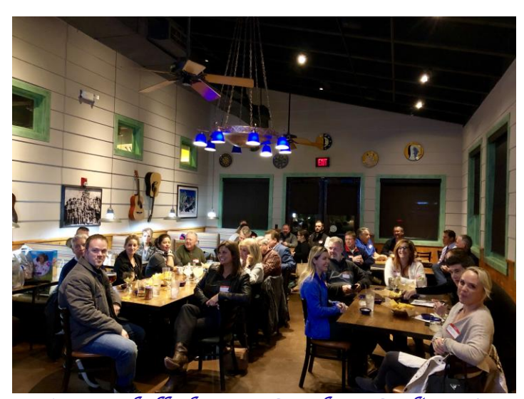
A room full of great Ganders, Goslings & Guests.