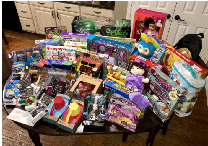
One check for $150 and 43 toys valued at $336 were collected for Community Partners of Dallas kids. Total donation value is $486.00