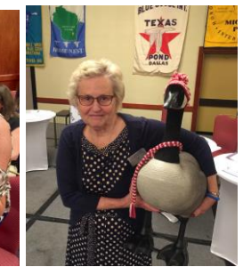
Gordy Goose came to embrace the Texas Pond members and to tell us to come see him in Edmonton next year.