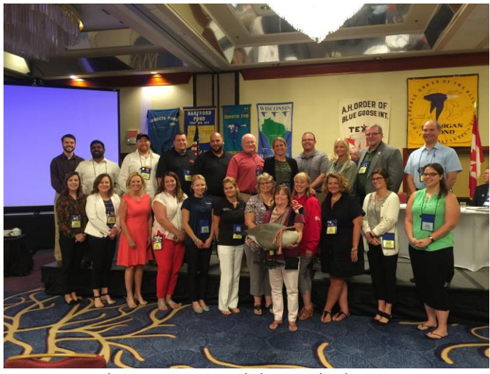
First Timers being recognized during the business meeting of the convention.