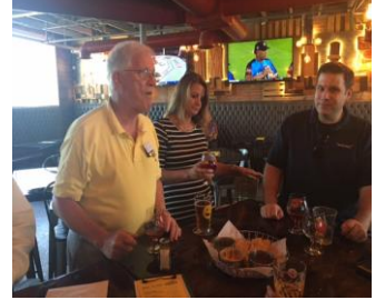
Enjoying some good company, air conditioning and a cold brew!