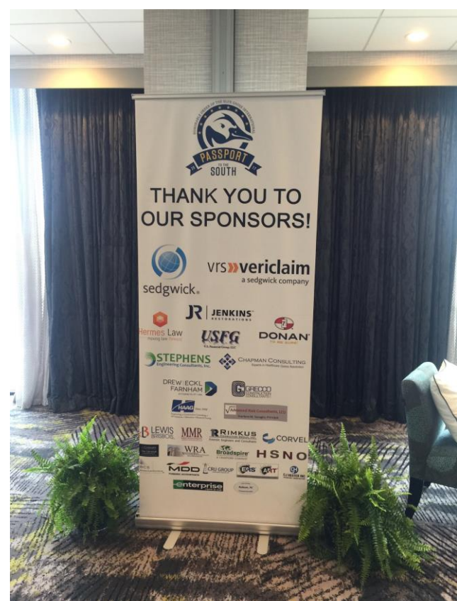
The convention was a huge success due to our many corporate sponsors.