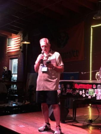
Following the charity event, that night was a Welcome Party at Savannah Smiles Dueling Piano Bar.