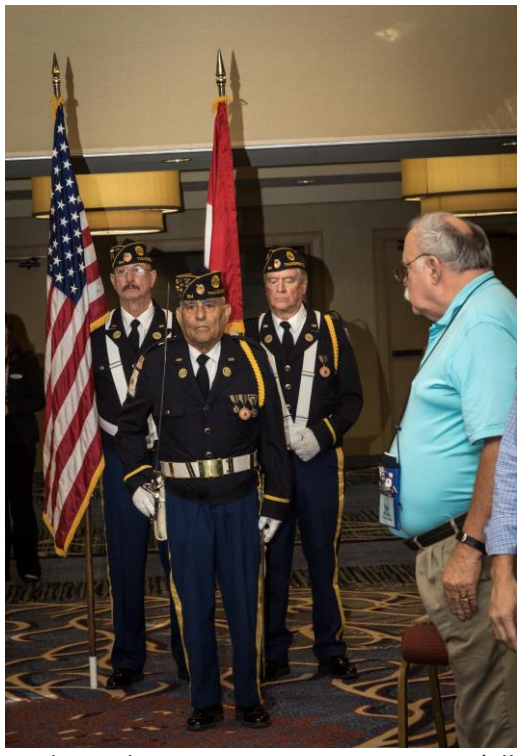
Color Guard was the American Legion Post 184 (all retired Vietnam vets)

National anthems of US and Canada led by the Gullah Geechee Ring Shouters Gospel Choir.