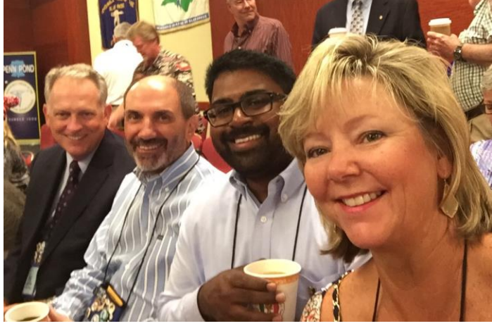
The Texas contingency! Look at that enthusiasm.