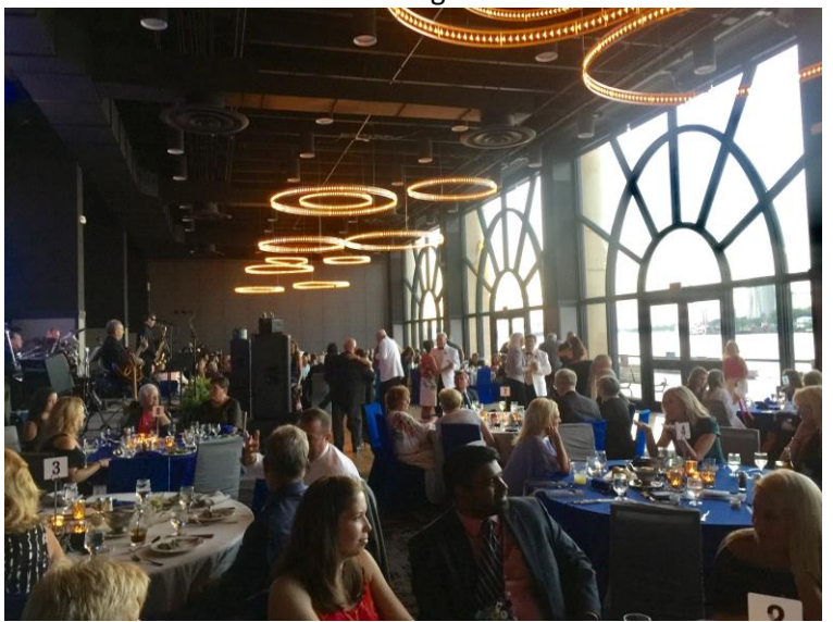
The convention ended with the "Dancing Thru the Decades" Gala.