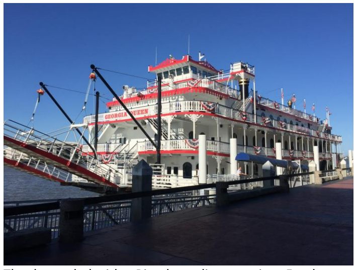
The day ended with a Riverboat dinner cruise. Food was fabulous and the night was perfect. An awesome relaxing night. Sailing up and down the Savannah River.