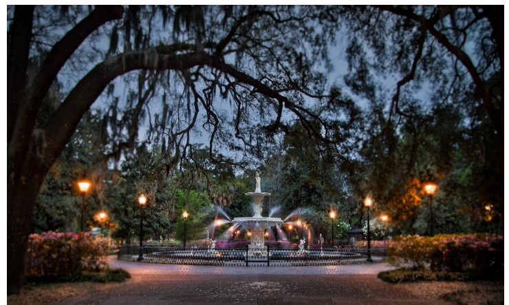
111 th Grand Nest Convention Southern Region Convention Savannah, Georgia July 9-15, 2017

Are we going to get to see you in Savannah???