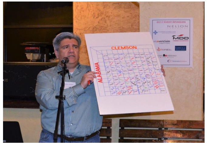
Football Squares for Sale