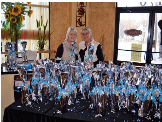
Bottles of wine for our Wine Pull

Monday, January 9, 2017 Football Pool Game ~ Wine Pull Event ~ Live Entertainment Benefiting our Scholarship Fund