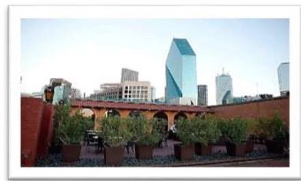
El Fenix Private Room & Rooftop Patio in Downtown Dallas

1601 McKinney, Dallas, TX 75202 / 5:00 pm - 8:00 pm $20 per person includes 2 drinks and appetizers Register online at www.BlueGooseTX.org or $30 (CASH ONLY) at the door