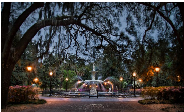
111 th Grand Nest Convention Southern Region Convention Savannah, Georgia July 9-15, 2017

This is just one of the sights in Savannah, Georgia the city for the 2017 Grand Nest Convention. Along with these two Savannah beauties: