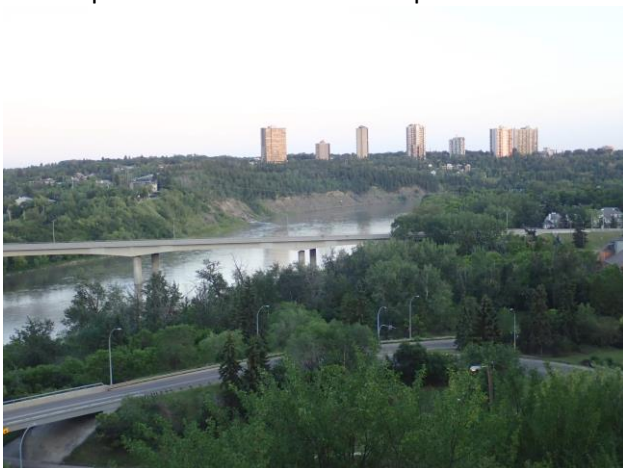
Looking across the river from the hotel in Edmonton

Now for a peak at the convention via pictures: