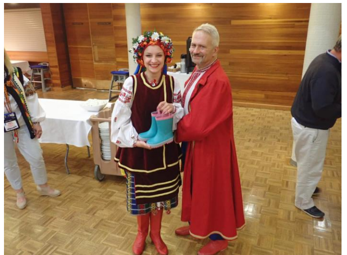
Ukrainian dress commonly associated with Ukrainian dance.