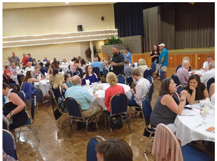
Ukrainian Family Dinner – Ukraine is known as the bread basket of the Soviet Union. Today 1 in every 5 Albertan can claim a Ukrainian ancestry.