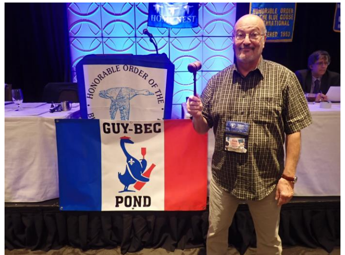
A creation of a new Pond in the Yukon Territory!