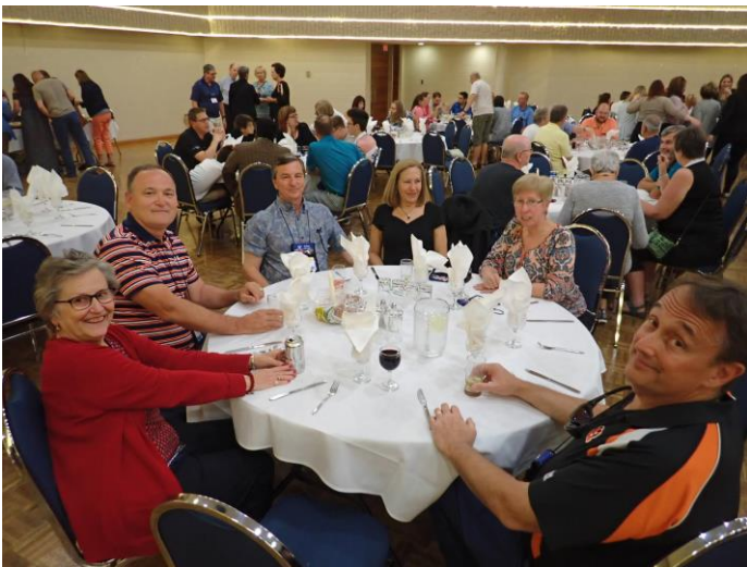
Virginia and Texas enjoying the Ukrainian Evening