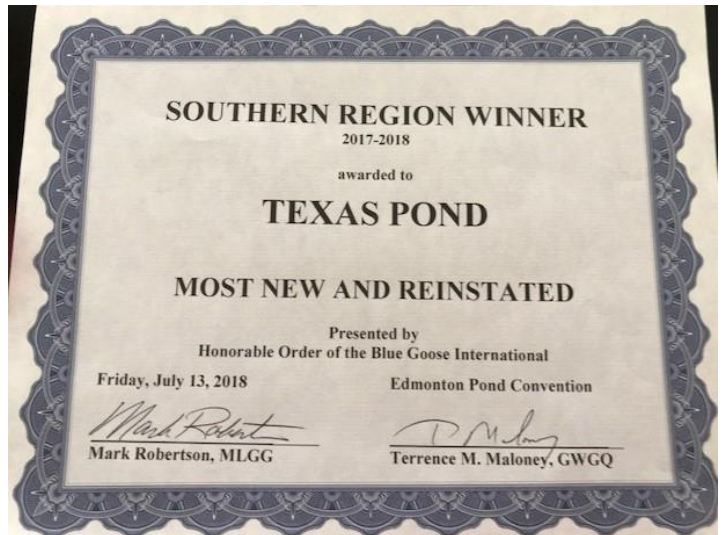
This is one of two Awards presented to the Texas Pond: The Most New & Reinstated members for the Southern Region in 2017-2018; and, the Texas Pond tied with the Edmonton Pond for the Communications Award.