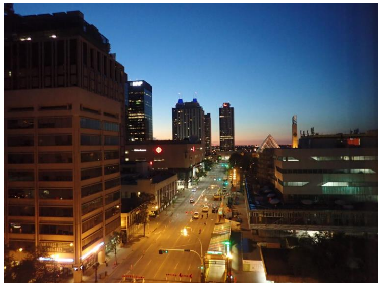
Looking down the street of Edmonton