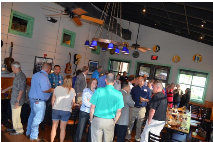
A room full of great fellowship!