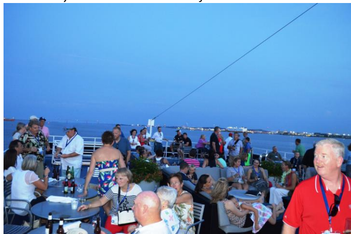
The Spirit Cruise (dinner) around Inner Harbor – Baltimore 2015.

They are headed to the boat for the dinner cruise.