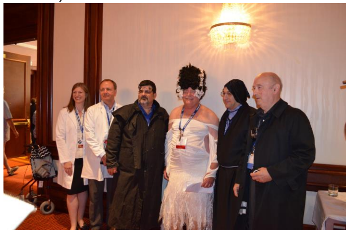
New York City Pond or should I say the Transylvania Pond – Model Initiation.