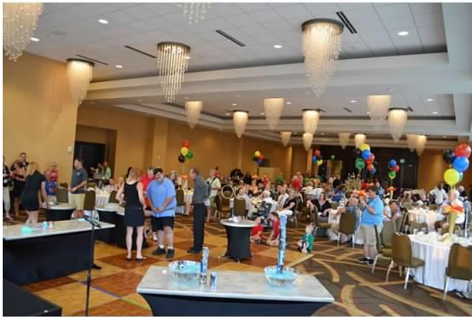
Welcome Party gathering!