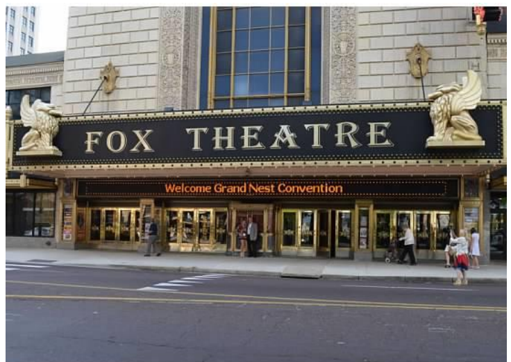
One of the highlights of this convention was the dinner at the Fox Theater. The following pictures only give a very brief glimpse into this incredibly beautiful renovated theater.