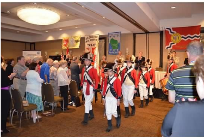
The Color Guard from the Veterans of Foreign Wars District 12 accompanied by the Lewis & Clark Fife and Drum Corp of St. Charles.