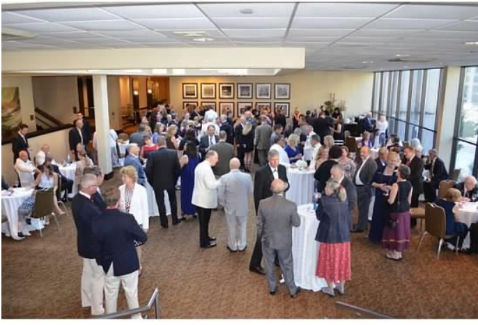
Grand Nest Reception prior to the Grand Banquet.