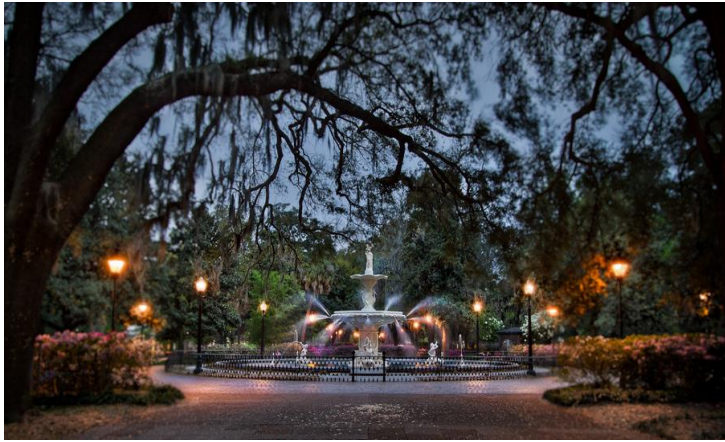
111 th Grand Nest Convention Southern Region Convention Savannah, Georgia July 9-15, 2017

This is just one of the sights in Savannah, Georgia the city for the 2017 Grand Nest Convention. Along with these two Savannah beauties: