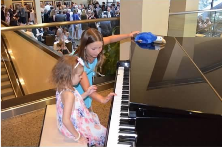
Two young gals sharing some friendship and music together.