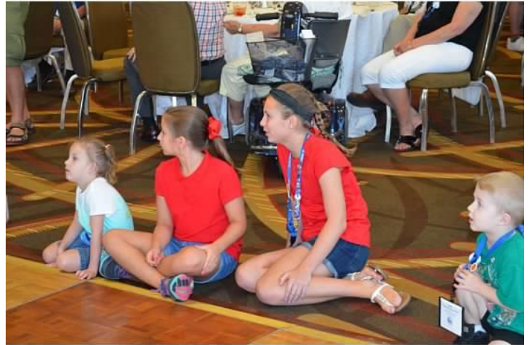
The youngsters watching the ganders (adults) demonstrate their skills at the Welcome Party.