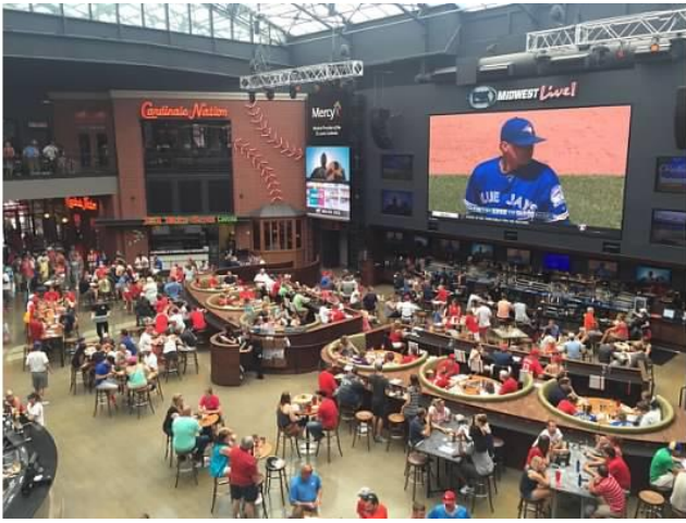
The Family Luncheon at the Ballpark Village.