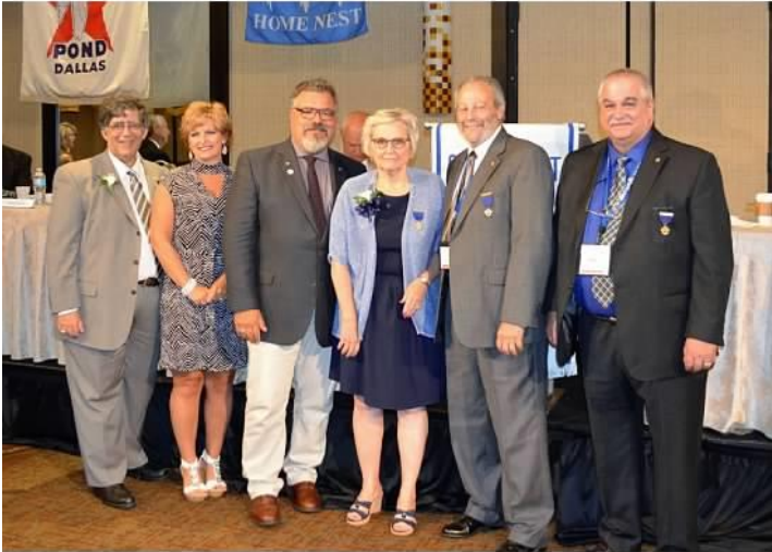
The newly installed Grand Nest Officers for 2016-2017, with the PMLGGs who did the installation.