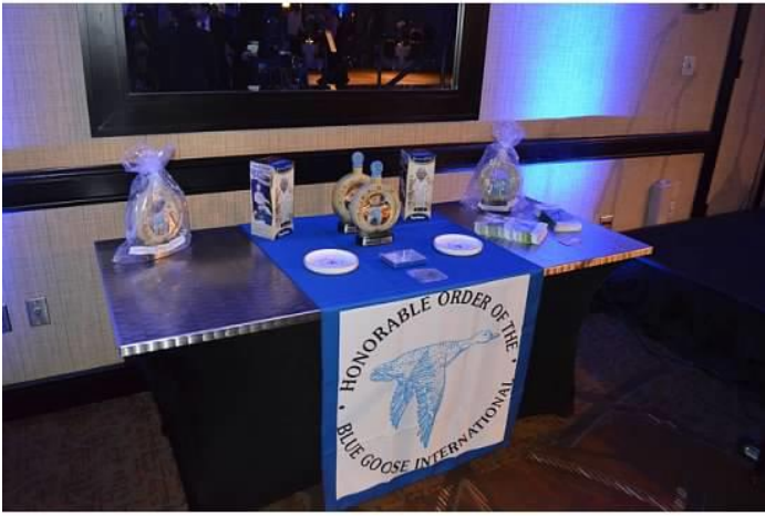
A table filled with mementos that ganders bid on.