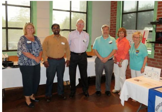
2017-2018 Texas Pond Officers