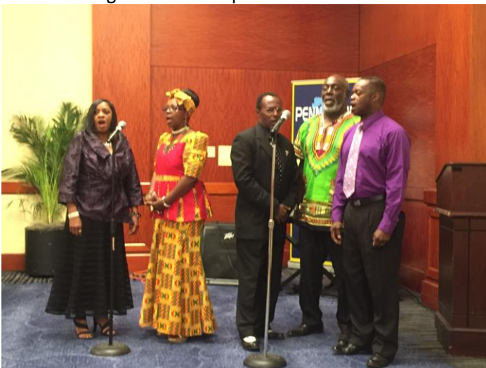
National anthems of US and Canada led by the Gullah Geechee Ring Shouters Gospel Choir.