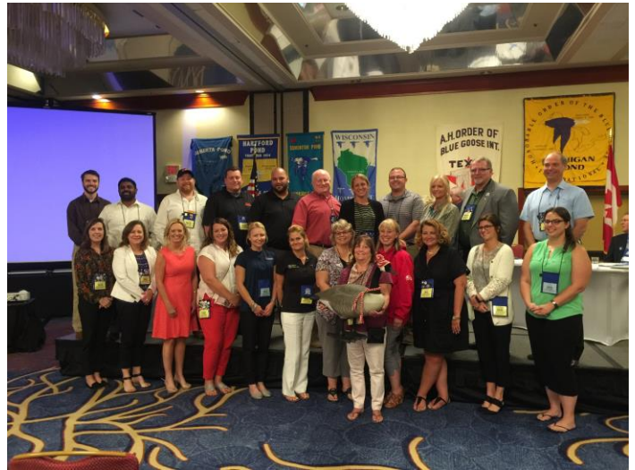
First Timers being recognized during the business meeting of the convention.