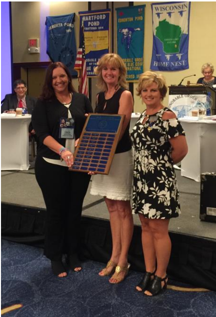
Cincinnati Pond was awarded the Gordon Crowther Charity of Excellence Award. The Texas Pond was given the honor to choose the winner.