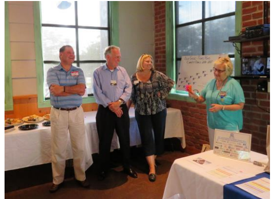
Recognizing our past Super Goose of the Year Winners.