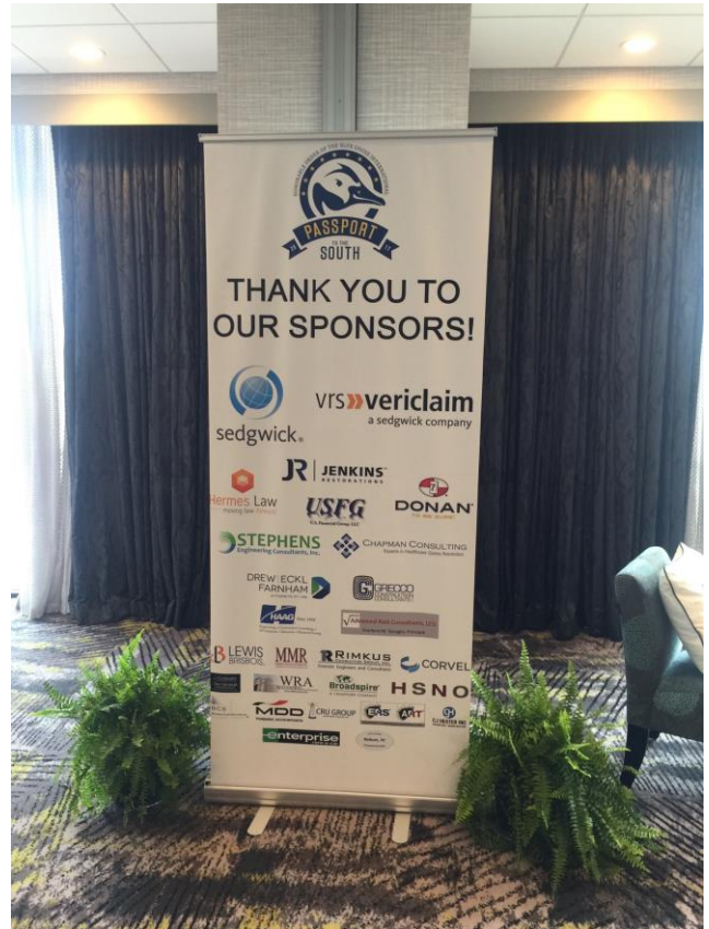
The convention was a huge success due to our many corporate sponsors.