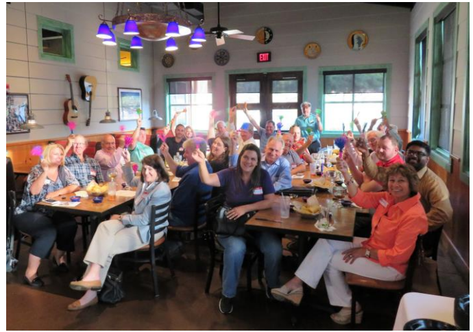
Giving a great big clapping hand to a great year!