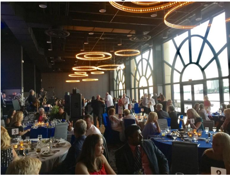
The convention ended with the "Dancing Thru the Decades" Gala.