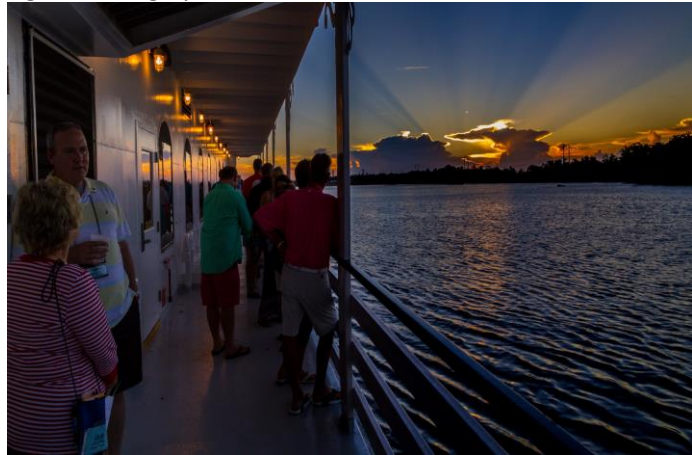
Such a peaceful & relaxing evening.