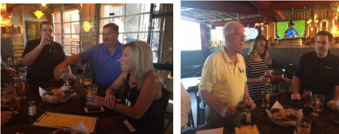
Enjoying some good company, air conditioning and a cold brew!

Meanwhile, several very-very venturesome Ganders decided that they would like to get together for some fun and sipping time while the above folks were in Savannah, so they met at Deep Ellum Brewery on July 10 th . There were 8-10 folks in attendance for some fellowship and a cold brew.