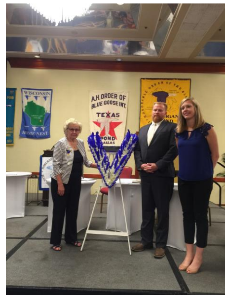
Tennessee Pond conducted the Memorial Service