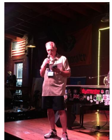
Following the charity event, that night was a Welcome Party at Savannah Smiles Dueling Piano Bar.