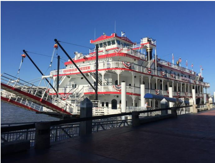
The day ended with a Riverboat dinner cruise. Food was fabulous and the night was perfect. An awesome relaxing night. Sailing up and down the Savannah River.