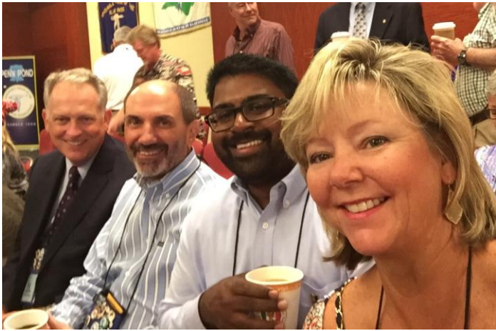
The Texas contingency! Look at that enthusiasm.