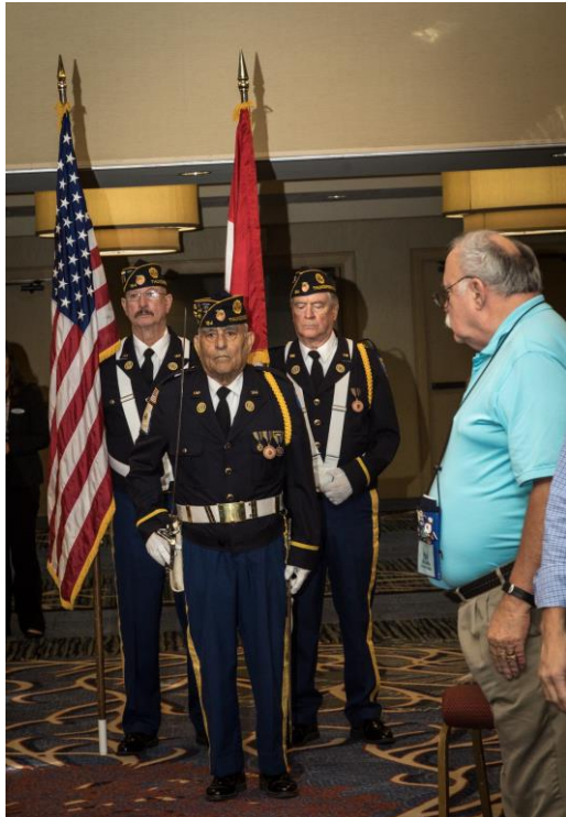
Color Guard was the American Legion Post 184 (all retired Vietnam vets)