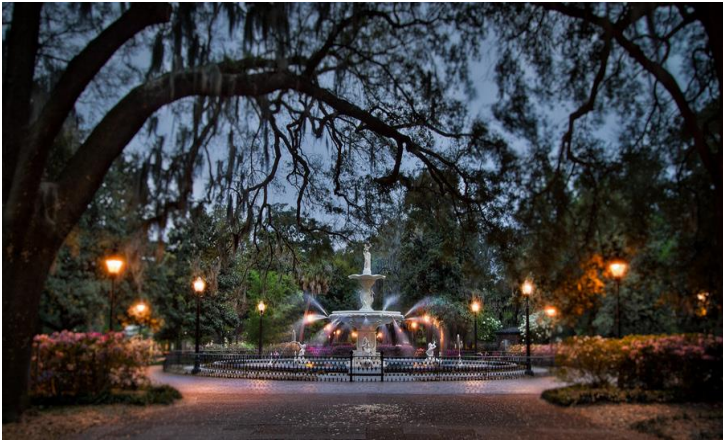
111 th Grand Nest Convention Southern Region Convention Savannah, Georgia July 9-15, 2017

And with boiling water comes steam.... And with steam, you can power a train.