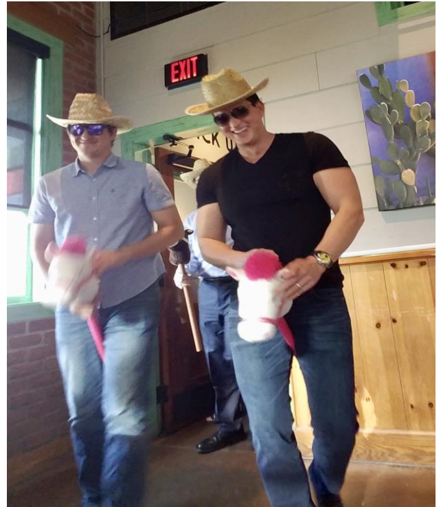
It has been a long ride for these Bucks and their beloved ponies!