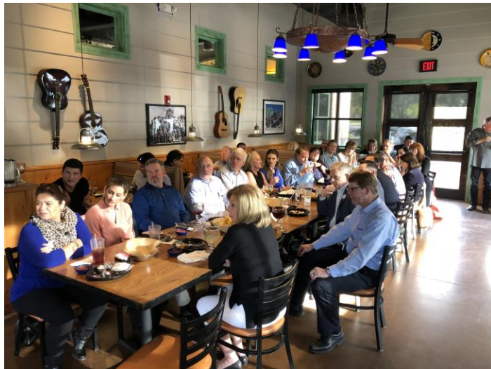
The Texas Pond is assembled and ready for business.