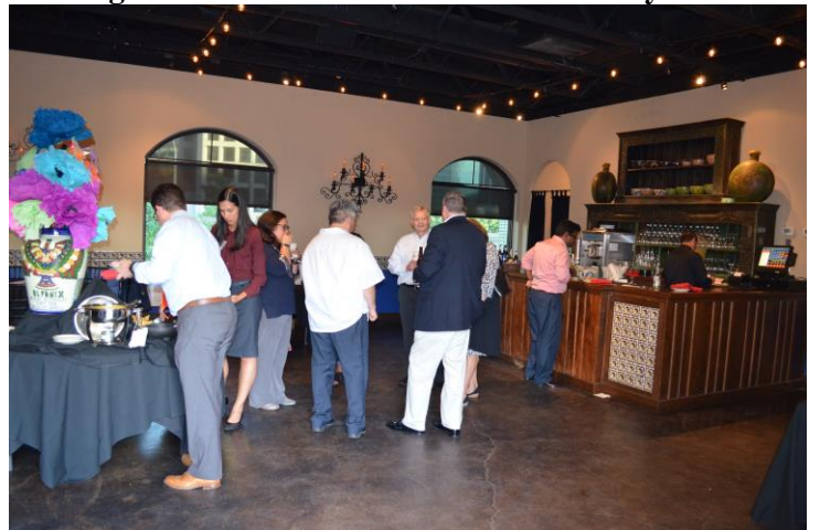
Following registration, it is off to get some food & a beverage.