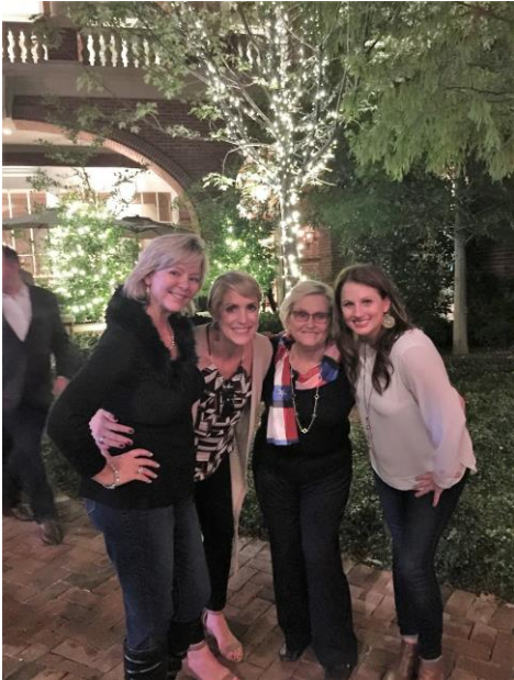
Now we grls did have some great fun! Can you tell?