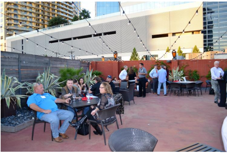
Ganders, Goslings & Guests enjoying themselves.