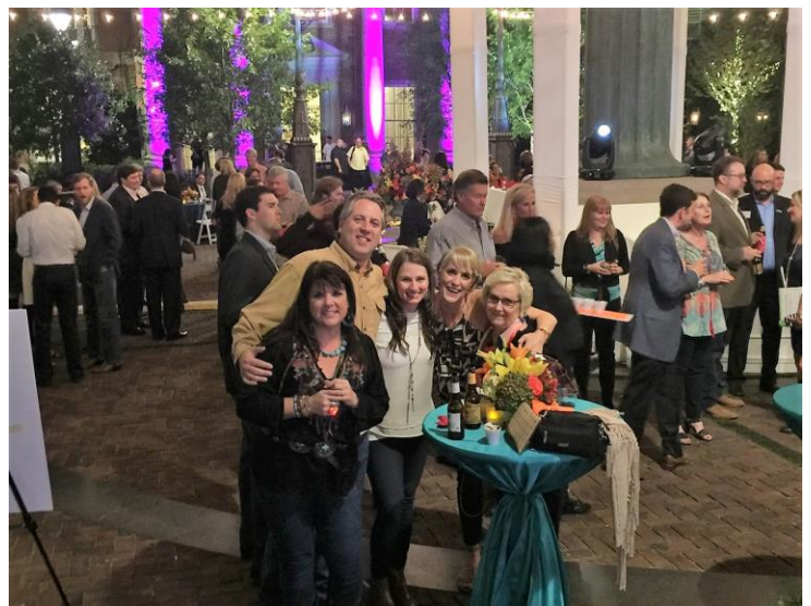
Here we are, having a really good time.