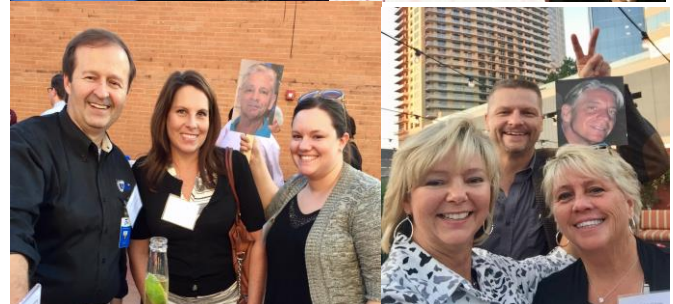
Notice anyone's face that appears in every picture?