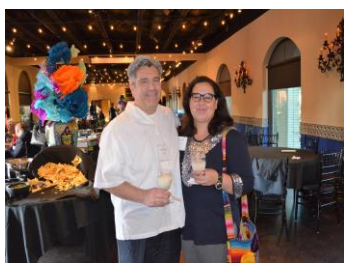
Oh, what fun we are having.