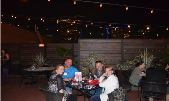
Good friends & industry colleagues enjoying themselves.