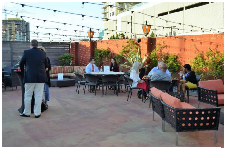
What an awesome location.

On a great October (early) evening several Ganders, Goslings and Guests gathered on the banks of the Texas Pond or should I say on the rooftop of El Fenix restaurant in downtown Dallas.