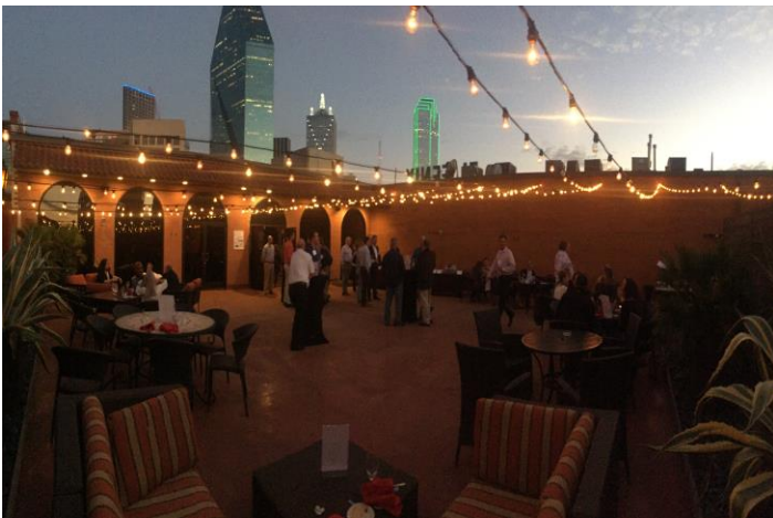
What an awesome evening from evening to after dusk!