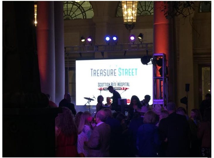
Emerald City Band provided some awesome music for the evening.

It was a truly awesome and fun event. One’s ticket included all food and drinks!!! This was a top-notch event from start to finish: proficient valet, food and drinks were even offered at the shuttle to the venue, check in was a breeze, the way they handled the silent auction was so easy, the gourmet food was truly gourmet and wonderful specialty drinks, great wine, fabulous entertainment, a gorgeous venue, excellent event preparation and layout, easy access to everything. Worth every dollar to attend. We all had a great time.