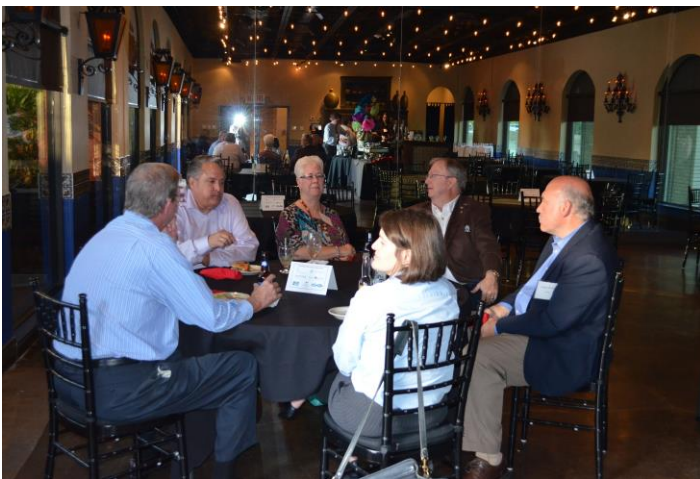
Good food, good beverages and good friends.