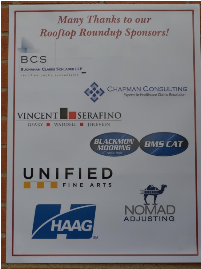
Our incredible sponsors.