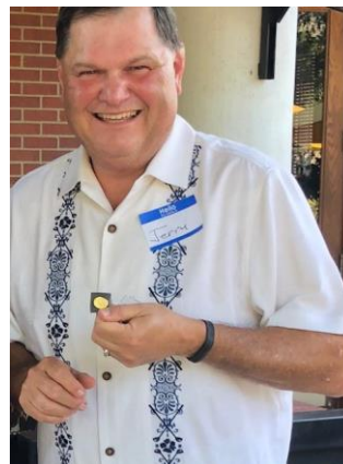
A 10-year Blue Goose member and our very 1 st Super Goose.