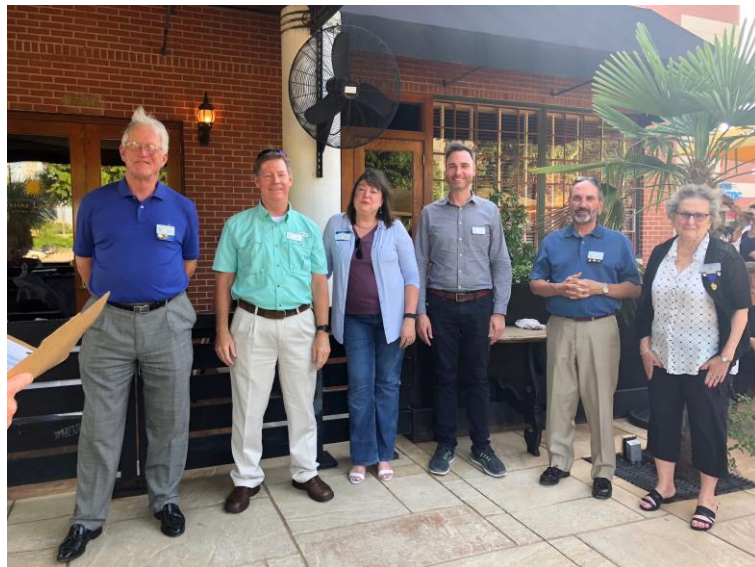
Your new officers...and yes, they are a little wind-blown!