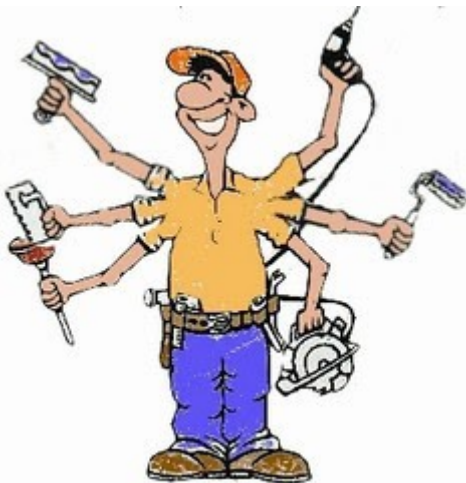
Mr. Creator/Builder - Jim Devall, MLG

Come join us at “On The Border” 4855 Beltline Road, Addison, Texas 75254 (West side of the Tollway on Beltline). We are meeting in the private room on the west side of the restaurant.