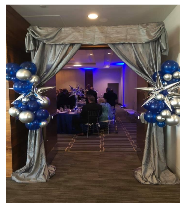
Entrance to the Grand Ball – The ending to one incredible convention.