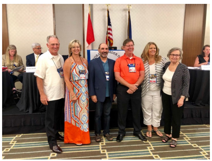
The Texas Pond was awarded recognition for our scholarship program.