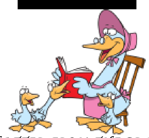
CHATTER FROM THE GRAND SUPERVISOR OF THE FLOCK (MOTHER GOOSE)