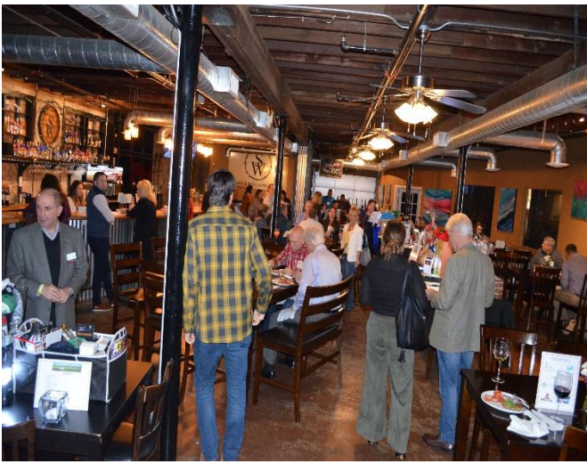
A room filled full of fun and fellowship.