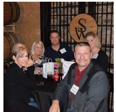
Blue Goose members & their guests enjoying the evening.