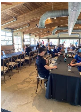
Lunch Time and most of all Cool Off Time!