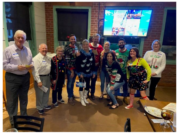
All the glorious & glamorous ganders & goslings, proudly posing in their sweaters with the Judges. Even a rainy night could not keep these folks away from the fun!