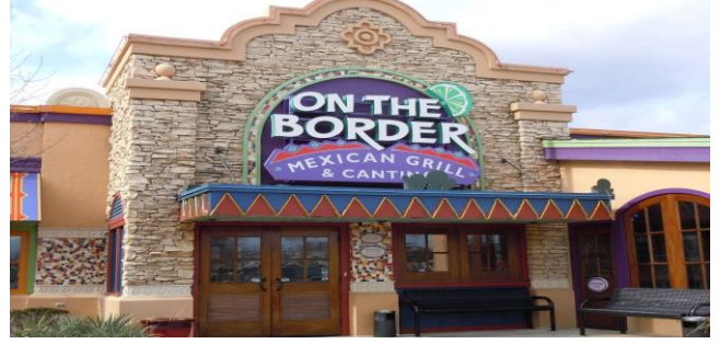
On the Border;4855 Beltline Road Addison, Texas 75254