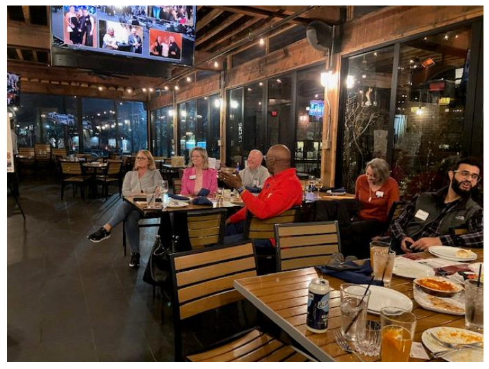
Those not playing the game acted as judges when certain rules were in question.