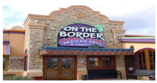
On the Border;4855 Beltline Road Addison, Texas 75254

Blue Goose – Texas Pond MONDAY, May 8, 2023 @ 5:30 PM