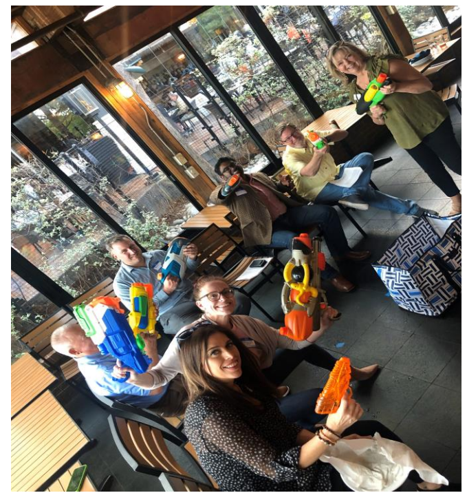
The Ganders who were sitting in camp, wanted to shower the new Ganders with a little moisture, so out came all the water pistols!