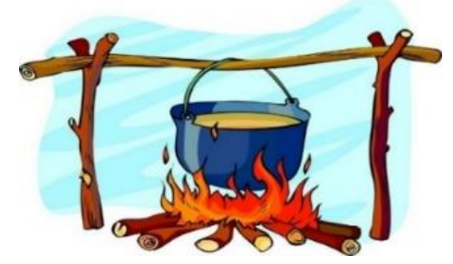
See what's cooking!

MAY MEETING – TEXAS POND 5:30 PM GANDERS & GOSLINGS & GUESTS NEW SLATE OF OFFICERS SECOND MONDAY, MAY 8, 2023 ON THE BORDER – ADDISON