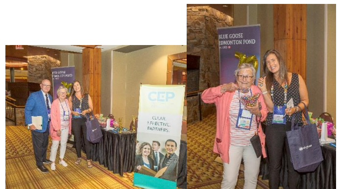
Visiting the Exhibit area and sampling the candy!