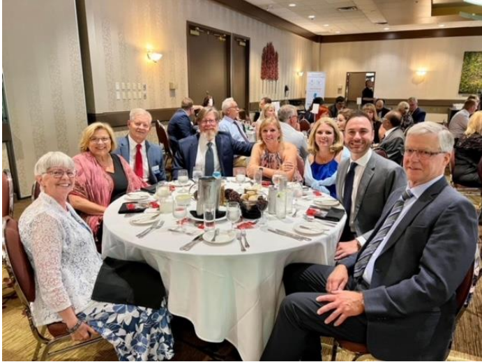
Texas Pond representatives enjoying the Grand Banquet!