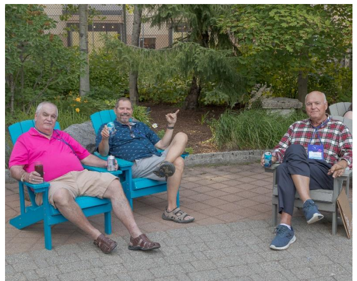
Old Men and their cigars.