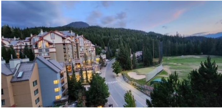
Whistler Hilton – high on the mountain, About an hour and a half from Vancouver airport. One could rent a car, take the bus transportation or a Sea plane.