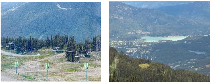
The view was amazing as one rode the Gondola!