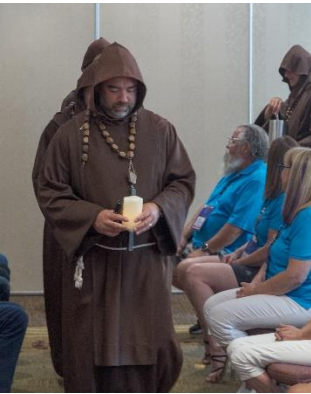
Model Initiation put on by Quebec Pond – 13 Goslings