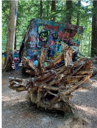
This Train Wreck occurred on August 11, 1956. The train was loaded with lumber and was headed to Vancouver.

The train got behind schedule so it attempted to make up time by increasing speed. On a narrow curve area, twelve trains jumped the track and became wedged in the trees. This accident shut down the track for several days. Trains was the only way resources to go between Squamish & Lillooet.