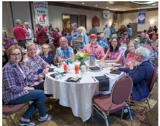
Canadian's in their plaid shirts at the Welcome Party.