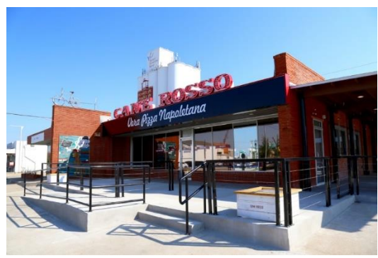
Fellowship & Food Time