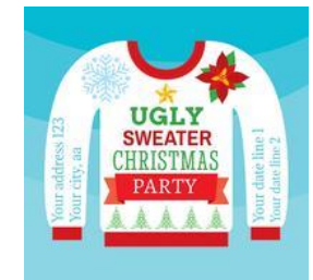
December 11th– Ugly Xmas Sweater Time