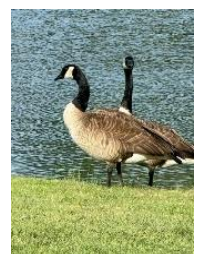
WGQ & KGGE