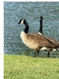
MLGG & SOF