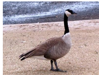
The Big Proud Gander Mitch Williams Most Loyal Gander

When both entities finished speaking the Texas Pond presented each with a donation of $1,500.