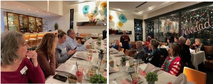
As everyone arrived at our December meeting the ganders brought items for either the cleaning or the bathroom baskets for the Stewpot's charity project.

A total of $750 in items was collected to be assembled into the various baskets. Our delivery of these baskets to the Stewpot was very timely as they just had three new families move in that would be in need of these supplies.