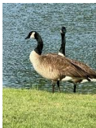
GOP & COP