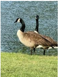
MLGG & SOF